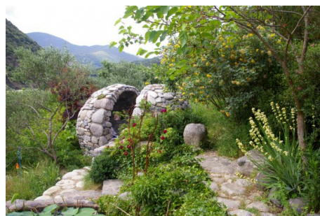
Parks and Gardens